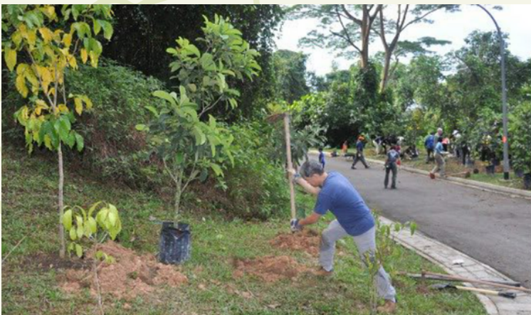
A fulfilling journey of greening the campus.

Want to know about upcoming opportunities for greening Singapore and NUS? Feel free to check out their calendar HERE!