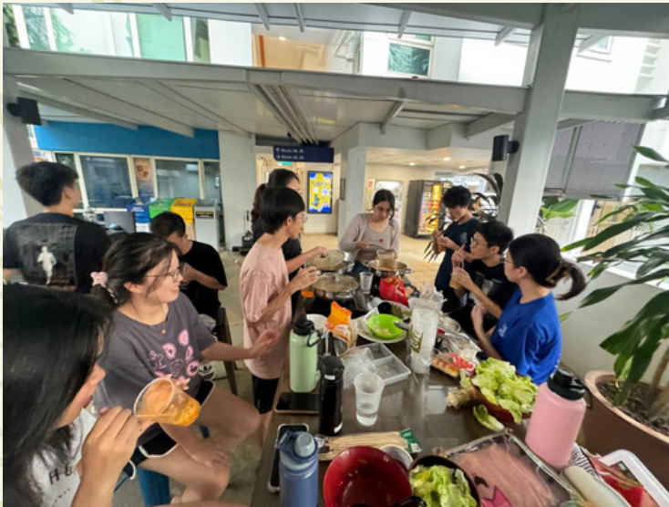
Participants of the event enjoying a hearty meal of steamboat with our facilitators at PH Foyer.

F&S team has kicked off this year's April Fool's Day with a free meal for all residents at the PH Foyer! Participants joining in the feast helped themselves with food cooked from the three soups our team had prepared beforehand, which include both vegetarian and halal options.