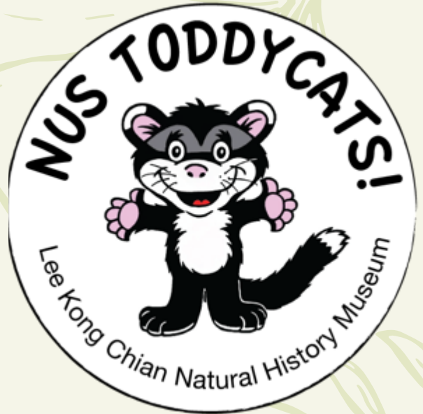
NUS Toddycats Logo