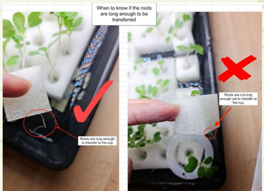
Demonstrating the correct and incorrect methods for transferring plants.

When transferring suitable plants into the cups, it is crucial to ensure that the roots protrude out of the cap. The plant should also not be fully submerged, with an air gap of around 6cm left between the air cup and nutrient film surface. This space accommodates air roots, which are vital for oxygen intake. Real roots, which will take nutrients from the algae solution, are connected to the plants' xylem system (the capillary system from roots to leaves).