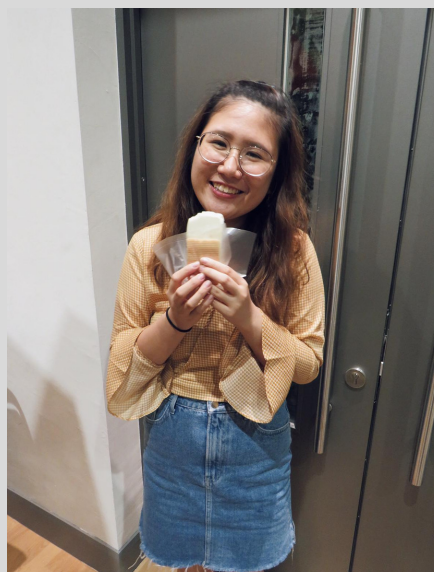
Atalya, Block 22– featuring a checkered bell sleeved top with a denim skirt