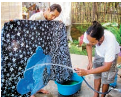
(LEFT) Washing off the remnant solution on the cloth.

project into existence and in Claire Bishop's writings on collaborative art practices, she argues for the acknowledgement of such singular authorial capacity which has been sidelined on percepts of democratic and ethical consciousness 20 . There are, however, other voices making a case for collective authorship – according of equal authorial credits to all participants within a collaborative project. These debates are pertinent in the context of Malam Di Jari