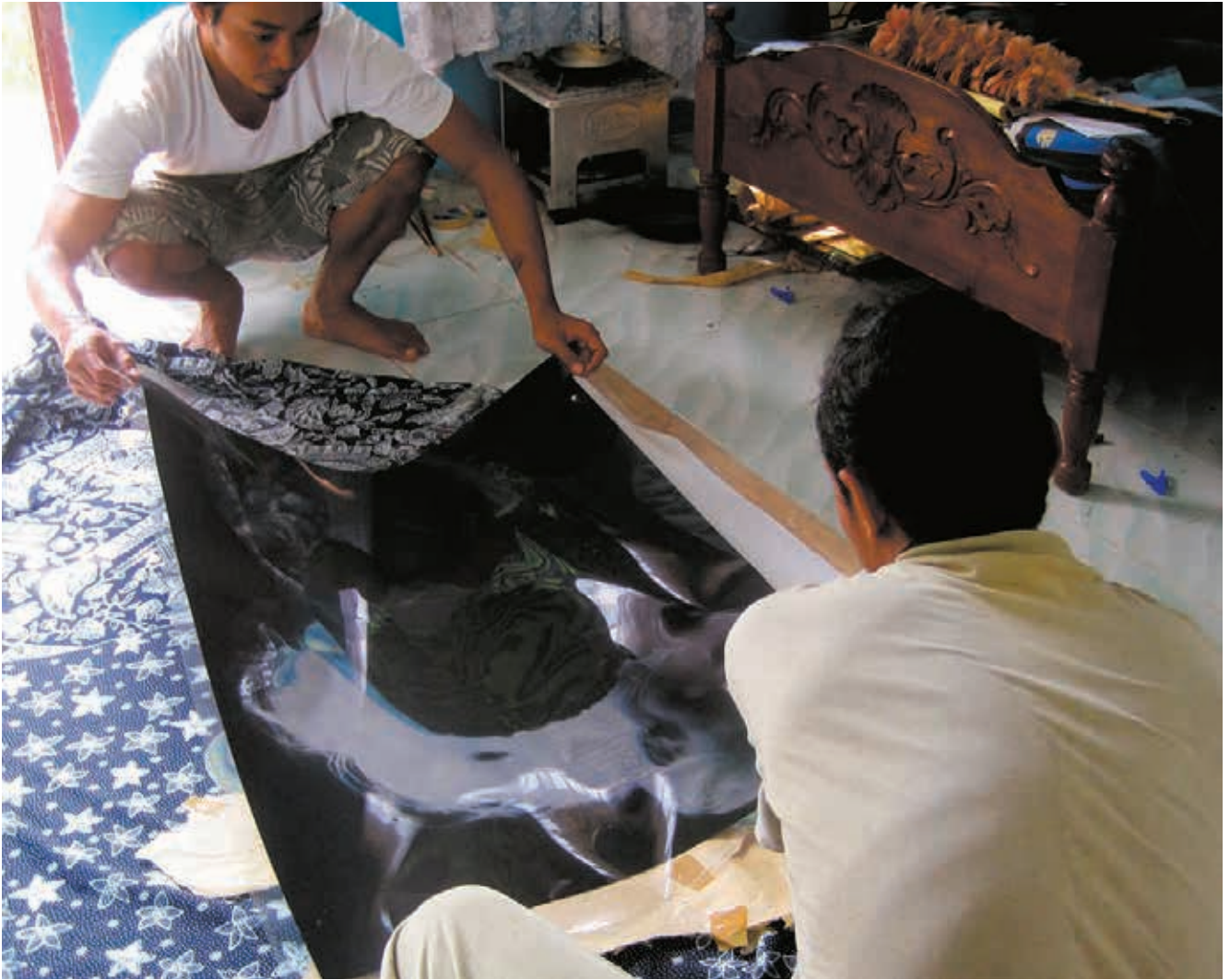
Placing the film negative on the artwork after a coat of light-sensitive solution is applied on the area where a print of the image is to be made.

for them to become co-producers of artworks that are consensual representations of themselves and their community.