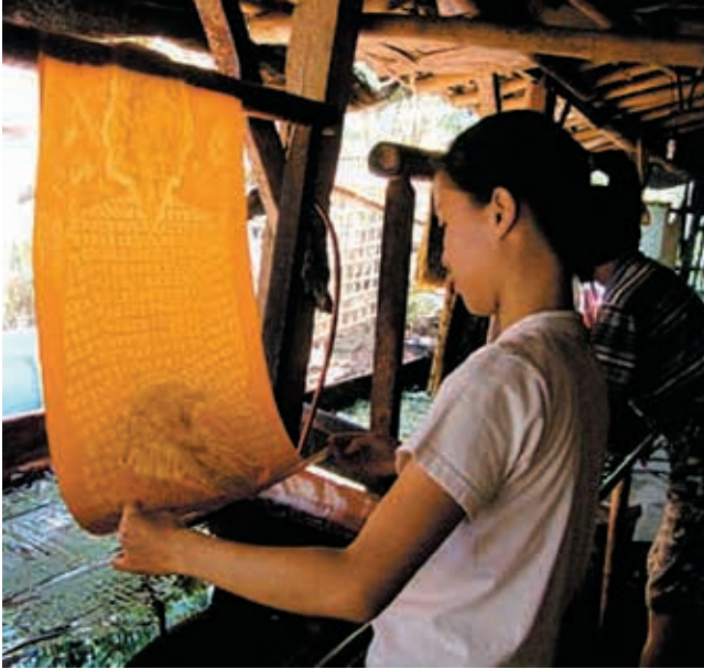
A piece of artwork after the first round of colouring.