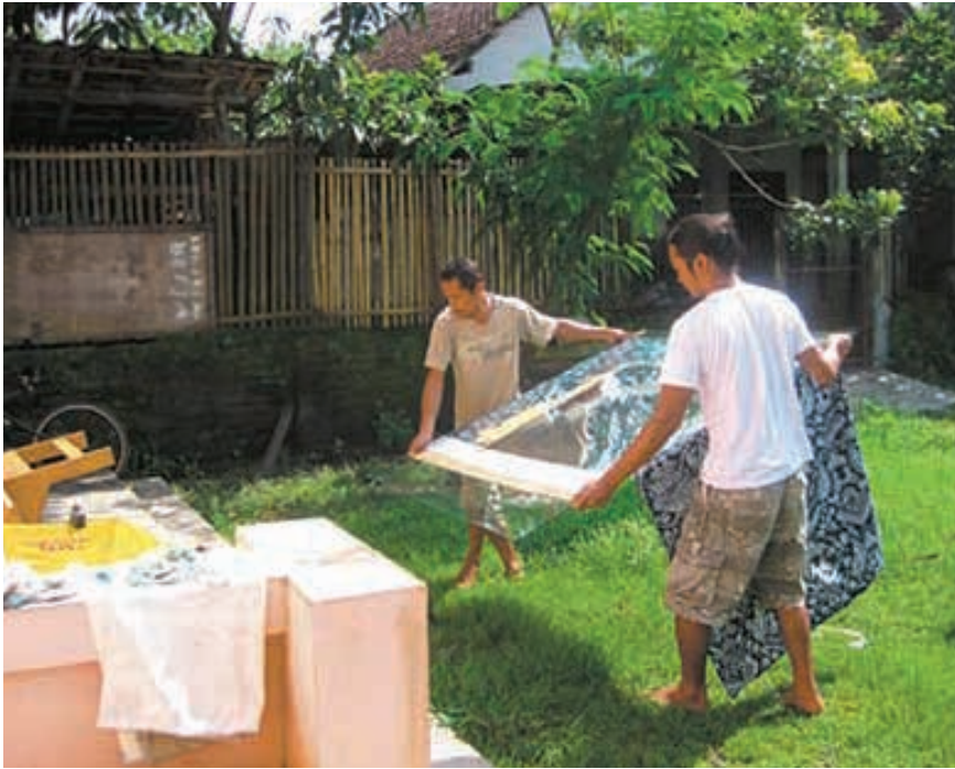
(TOP) The assembly of cloth and negative is sandwiched between two glass plates and exposed to light. The solution on the cloth changes colour leaving a positive of the image.