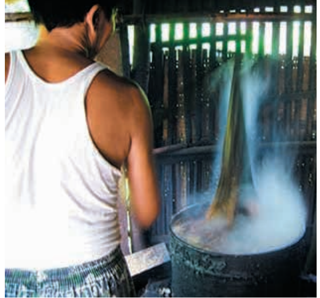
Dipping the fabric in boiling water to remove the wax.

the cyanotype technique came up as the only choice available to them.