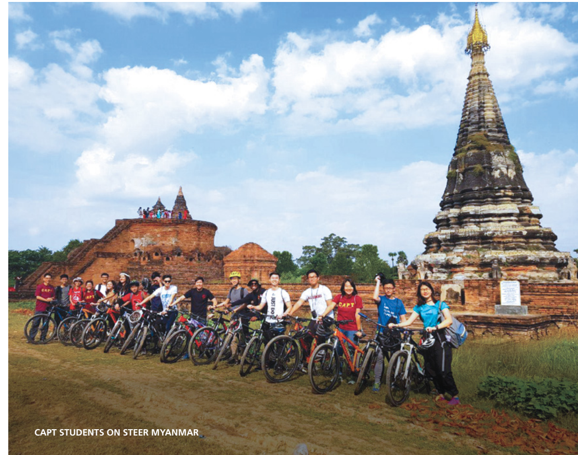
CAPT STUDENTS ON STEER MYANMAR

GRO also offers other short-term programmes for students to participate in. These programmes, generally lasting from two weeks to a month, provide students with the opportunity to expand their outlook and gain valuable learning experiences, while exposing them to the historical, social, economic, political and cultural aspects of different countries.