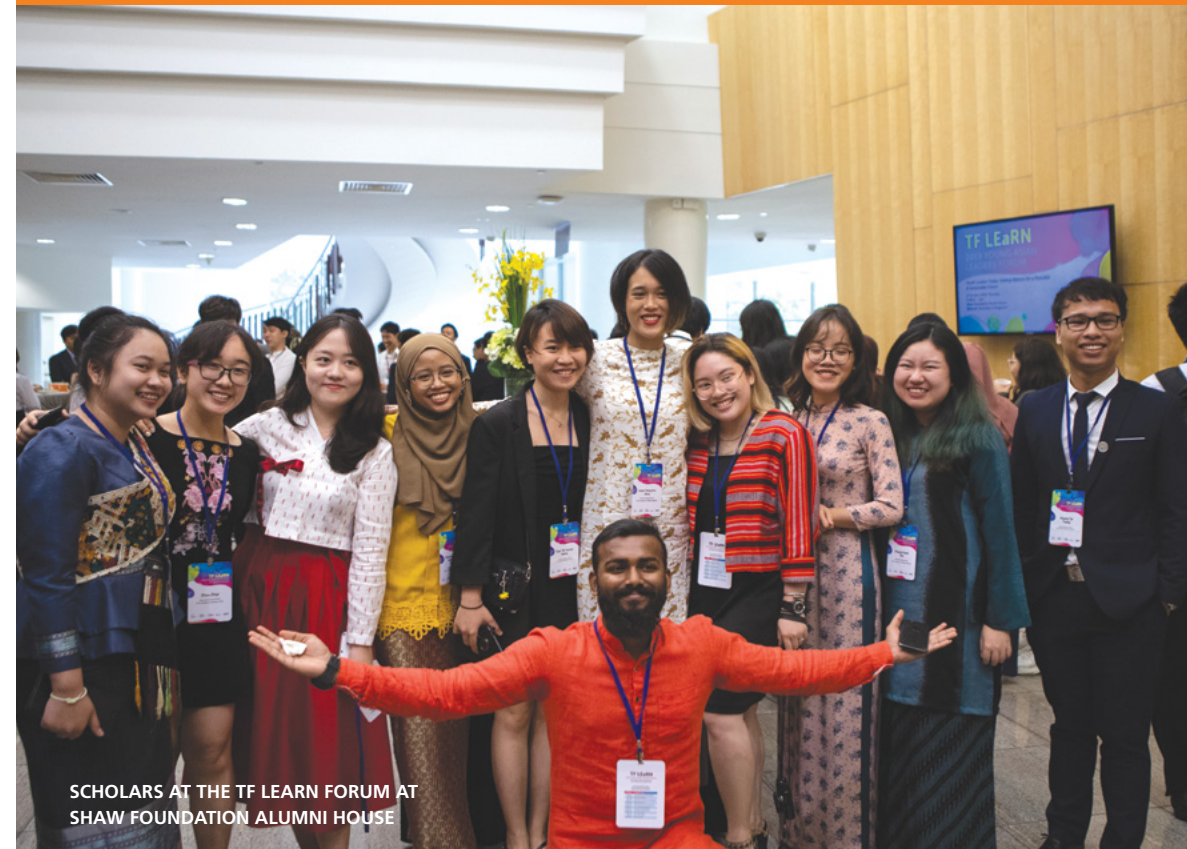
SCHOLARS AT THE TF LEARN FORUM AT SHAW FOUNDATION ALUMNI HOUSE