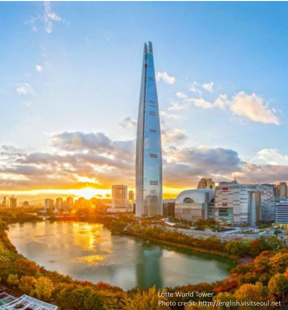
Lotte World Tower