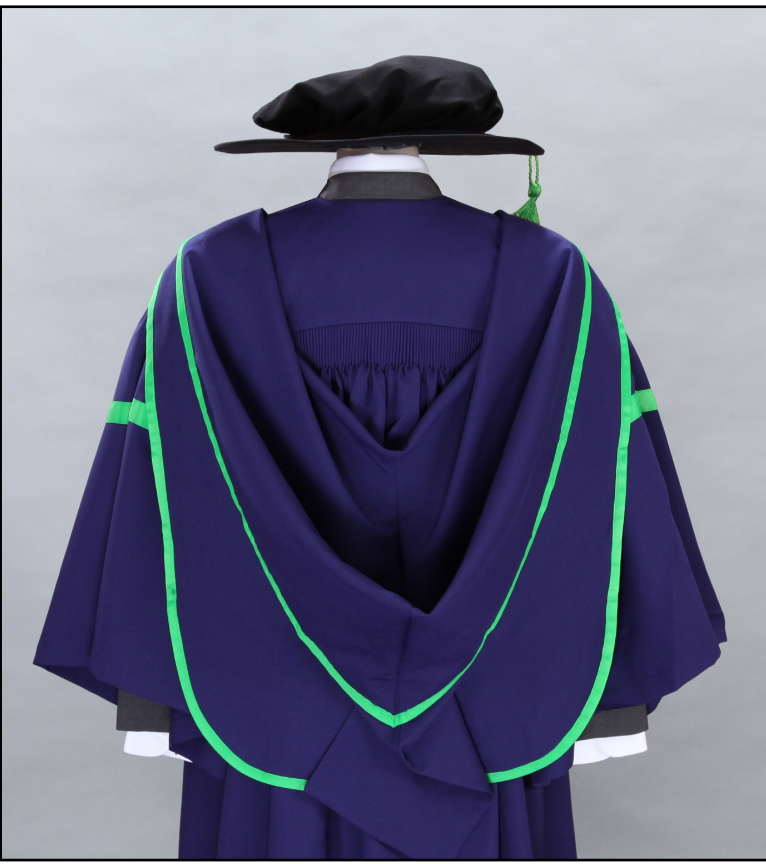
Final View of Academic Dress