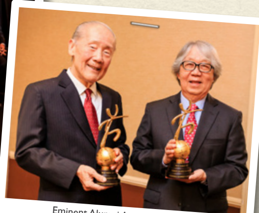
Eminent Alumni Award Recipients Prof Tommy Koh and Prof Wang Gungwu

In 2015, 19 exceptional NUS alumni were honoured at the biennial NUS Alumni Awards ceremony. Three categories of awards were presented: the 'Eminent Alumni Award', the 'Distinguished Alumni Service Award' and the 'Outstanding Young Alumni Award'. The event held at the Marina Mandarin Hotel on 19 November was attended by 290 guests consisting of award recipients, their families and friends, distinguished guests, alumni, staff and students.