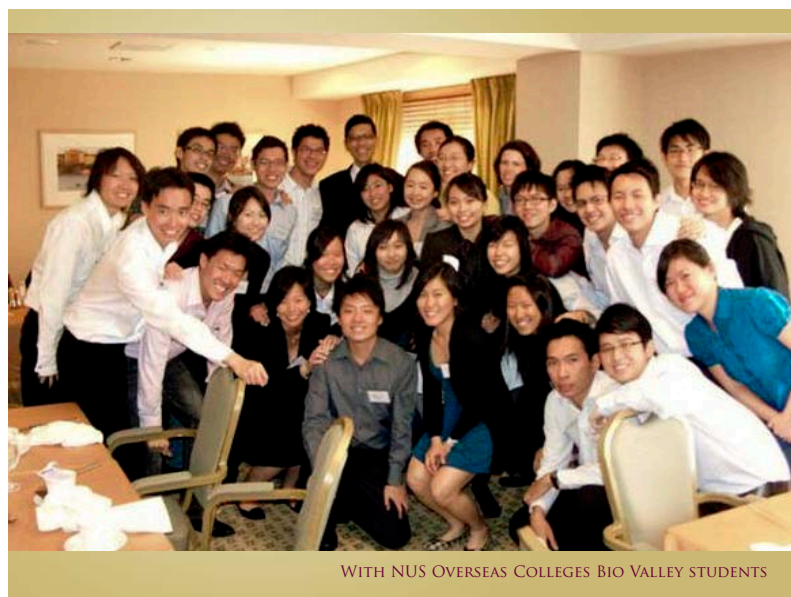
WITH NUS OVERSEAS COLLEGES BIO VALLEY STUDENTS

Last week, I was in Philadelphia and I took the opportunity to meet with 30 of our students at the NUS Overseas College there. Each of them was interning in a small start-up company. Over lunch, they told me about the various challenges they faced. Many of them had to choose the specific areas they would focus on and decide how to approach these. Some were involved in marketing research and sales, working with a range of companies. Others were involved in laboratory research, designing and carrying out experiments. It was hard and challenging work, but what impressed me about the group was their great enthusiasm, their confidence and independence, and above all, their obvious “can-do” spirit.