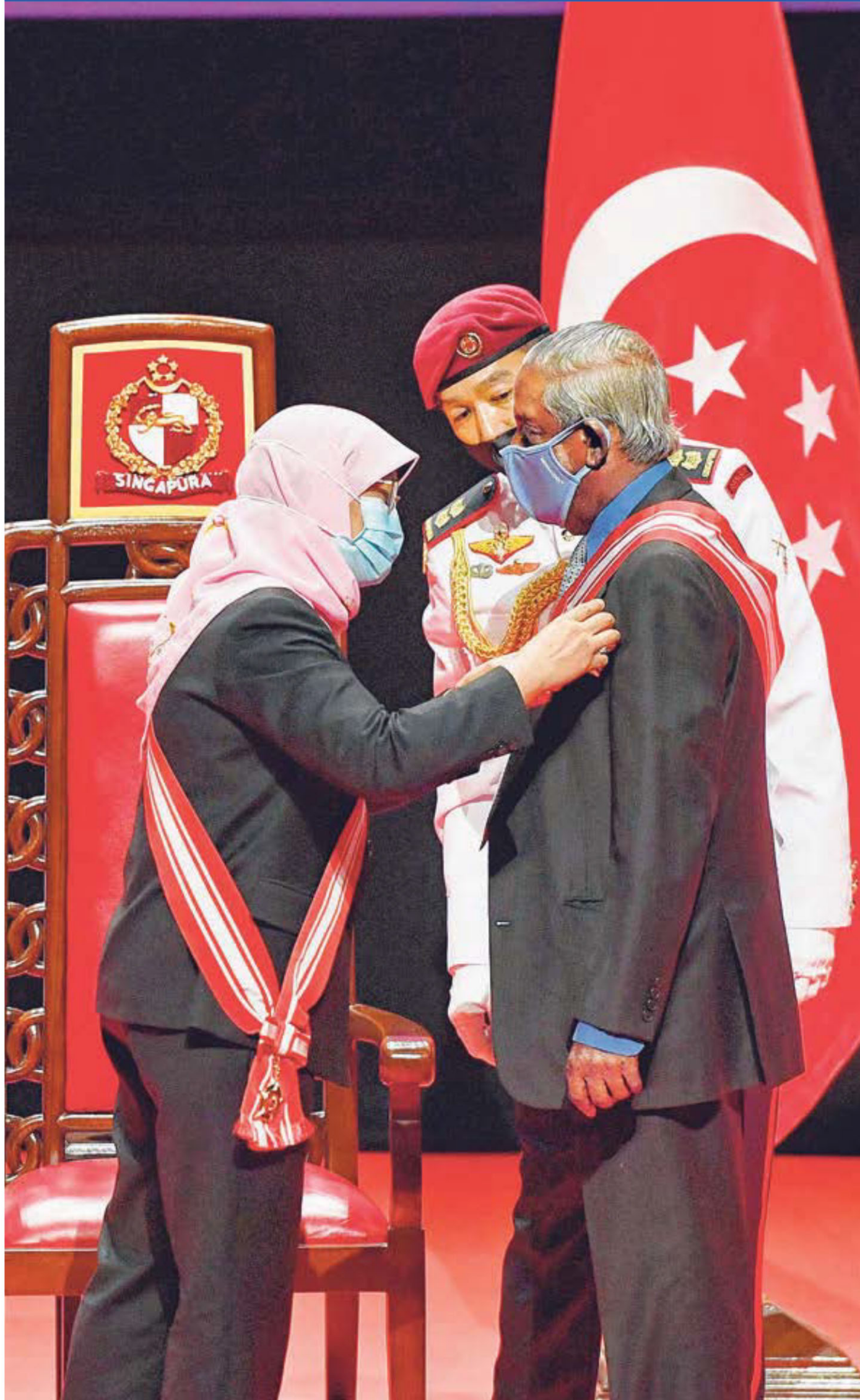
President Halimah Yacob presenting the Order Of Temasek (with High Distinction) to former minister S. Jayakumar at yesterday's National Day Award investiture held at ITE College Central. Professor Jayakumar topped the list of more than 500 people who received National Day honours. Yesterday's ceremony, which had been postponed from last year due to the pandemic, was organised in accordance with safe management measures, with participants masked and kept a safe distance apart. SEE SINGAPORE • B3