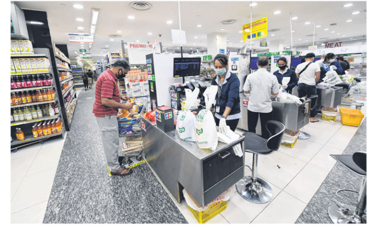
Customers at Mustafa Centre in Little India yesterday, after the supermarket was reopened with precautionary measures in place.