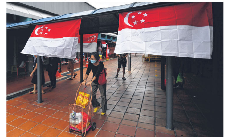
Singapore flags put up at Marsiling Lane Market and Cooked Food Centre. Further easing of circuit breaker measures will begin on Tuesday.