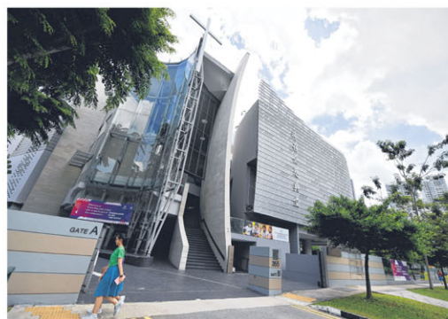
MOH said it has determined that the primary case in the Grace Assembly of God cluster is case 66, a 28-year-old Singaporean who works at the church and lives in Mei Hwan Drive.

Cases 83 and 91 were well and had no symptoms during recent investigations, but records showed both had earlier sought medical treatment, the ministry said.