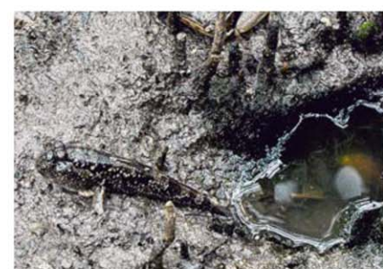
Below left: A crab and a mudskipper in the soil near the mangroves at Sungei Buloh Wetland Reserve during low tide.

how often they visit them, among other questions, and by scanning through images uploaded on social media, we got a sense that people visited mangroves for social and education reasons, and that they are tourist attractions as well.