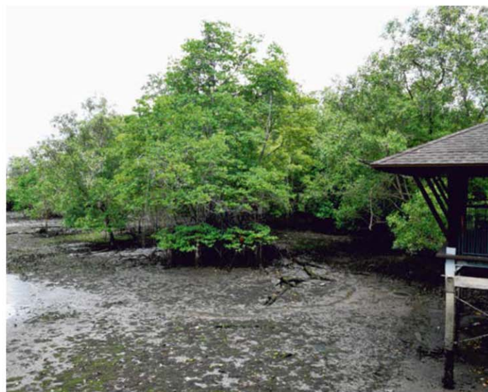
Mangroves are nursery grounds for young fish, which hide among the roots of the plants to protect themselves from predators.