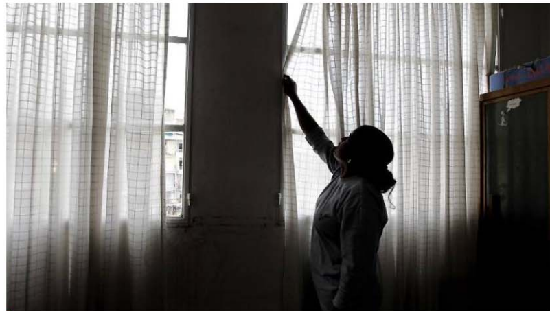
File photo of a foreign domestic worker.

Based on this framework, migrant worker groups, including FDWs, typically fall within the high warmth but low competence category. Groups in this category tend to be marginalised in society.