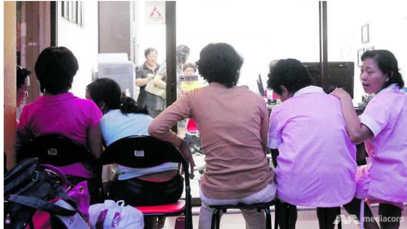
Domestic workers in Singapore

In order to truly advance the conversation on foreign domestic workers (FDWs), we must break away from the current stereotypes of FDWs that sustain the inequality, say two psychology experts from the National University of Singapore.