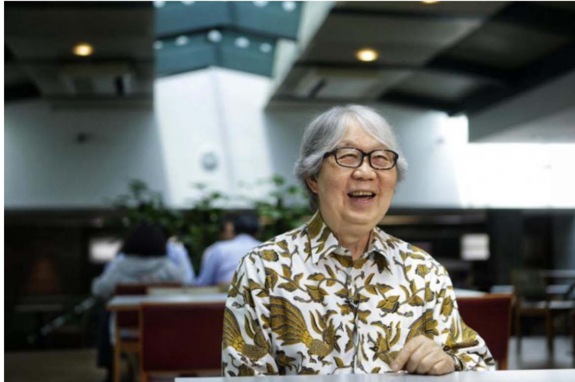
Ambassador-at-large Tommy Koh has been chosen to receive India's Padma Shri Award, one of the country's highest civilian honours.

PUBLISHED JAN 26, 2018, 10:35 AM SGT | UPDATED JAN 29, 2018, 12:12 PM