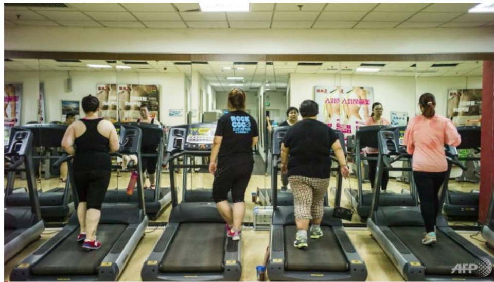
In China, home to the second largest number of obese people worldwide the northern port city of Tianjin operates a fat reduction hospital seen here in 2015.