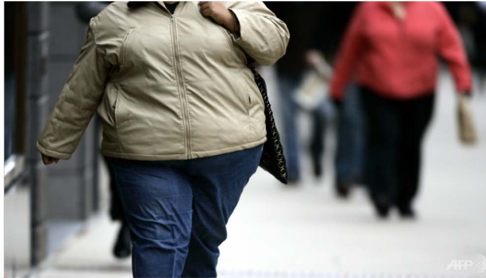
Of about five billion adults alive in 2014, 641 million were obese, a survey shows.

Among Southeast Asian countries, healthcare and productivity losses from obesity are highest in Indonesia (US$2 billion to US$4 billion), Malaysia (US$1 billion to US$2 billion) and Singapore (US$400 million).