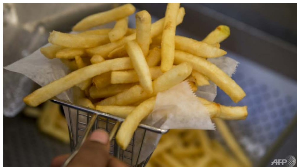
Other researchers believe taxing salt and saturated-fat could save Australia billions in health care costs and extend people's lives.

India's western Maharashtra state banned so-called "junk food" in school canteens over concerns about childhood obesity, and Hong Kong will soon introduce a labelling scheme for pre-packaged foods in schools.