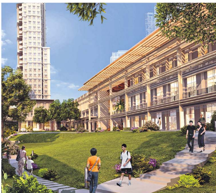
Artist's impression of Yale-NUS College in Dover Road, spread over 63,000 sq m.