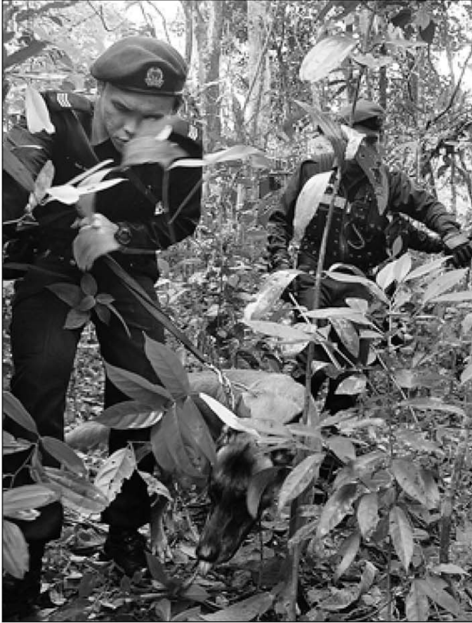
Police officers searching a forest during the massive manhunt for Mas Selamat in 2008. The majority (95 per cent) of the respondents sampled were aware of his escape.

ducted an exercise in 2010 to test how Singaporeans would react to threats in a public area.