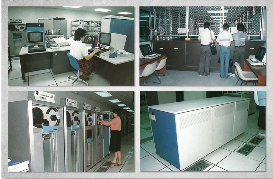
Clockwise from top: 1. the School's supercomputers; 2. computer printout queue; 3. 1.5 MIPS processor; and 4. magnetic loading disks.

As the co-founder of networking site LinkedIn, Reid Hoffman, said, "The future is sooner and stranger than you think."