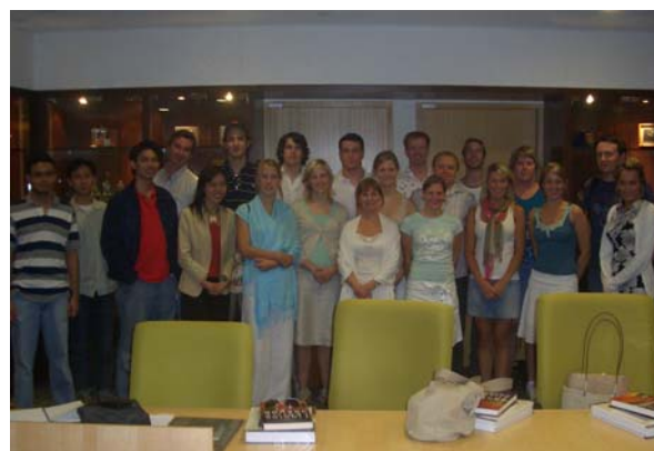
Group photo of the Norwegian Students.