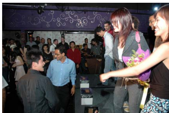
Some snap shots of the event.