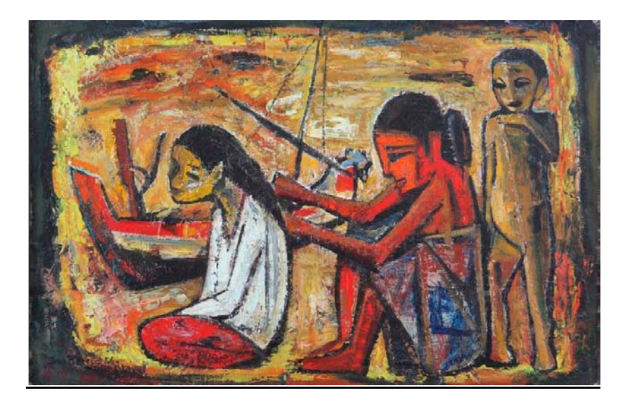
Cheong Soo Pieng, Motherly Love (1956), collection of NUS Museum

In Maidens Under a Tree , with inspiration drawn from his trip to Bali, Liu Kang attempted to paint a Chinese scroll composition combining realism and semi-abstract forms. The artist once said that when he picked up a brush to draw, he was instinctively reminded and motivated by the great Chinese tradition, notwithstanding his allegiance to western art forms.