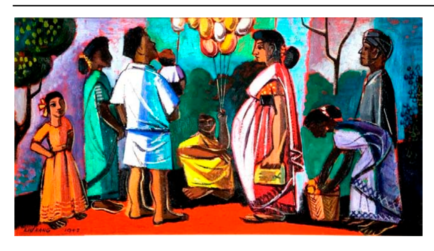
Liu Kang, Indian New Year (1957), collection of NUS Museum