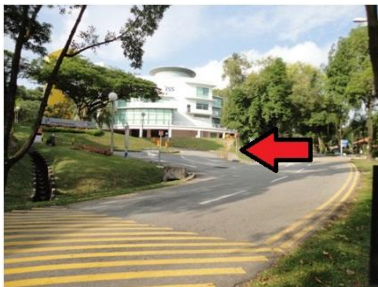
(b) picture of the entrance to carpark 12B