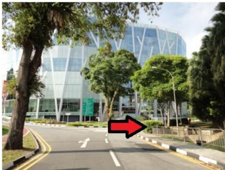
(a) picture of Y junction (make a right turn at the junction)