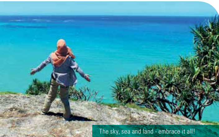
The sky, sea and land - embrace it all!