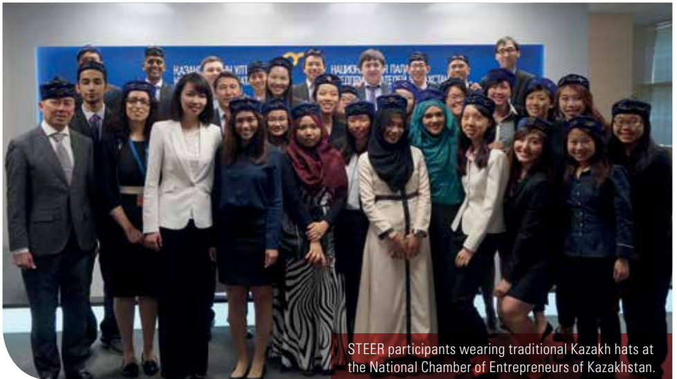
STEER participants wearing traditional Kazakh hats at the National Chamber of Entrepreneurs of Kazakhstan.