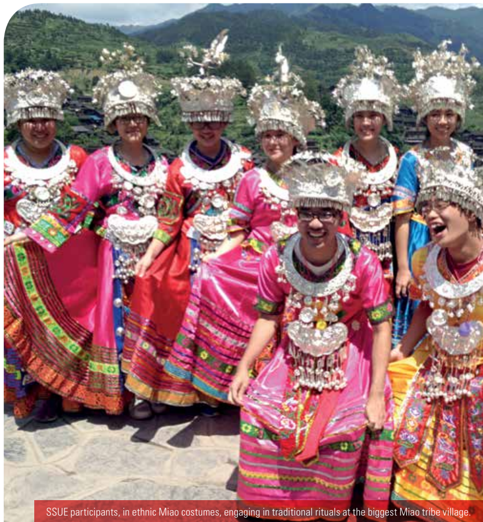
SSUE participants, in ethnic Miao costumes, engaging in traditional rituals at the biggest Miao tribe village.